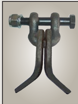
Y BLADE Up to 1/2" BRUSH