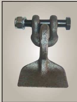
HAMMER KNIFE Up to 1 1/2" BRUSH