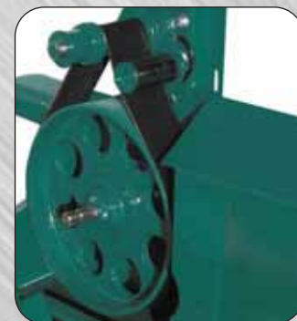
Power band fan speed up system with built-in overrunning clutch