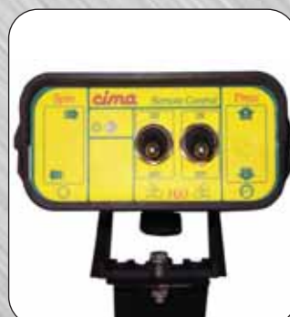
Electro valve controls to operate on, off, left, and right spraying