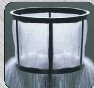
Shower head is built into the main strainer basket to easily put wettable powders into suspension