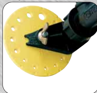
Rotating yellow calibration discs, adjusts easily to provide accurate and constant regulation of application