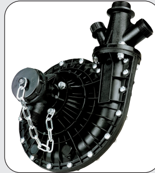
Low pressure centrifugal pump made of anti-corrosive materials requires little maintenance