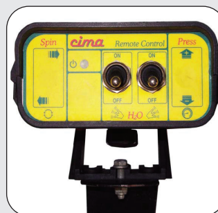
Electro valve controls to operate on, off, left, and right spraying - P55 only