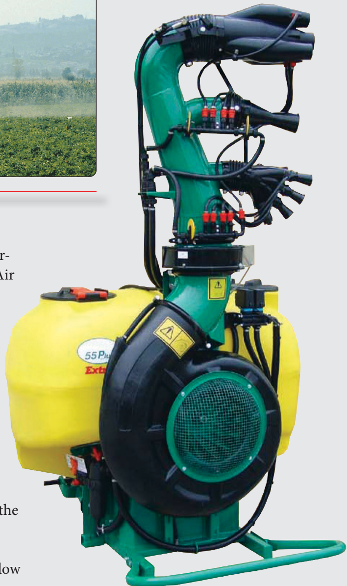
Model P55EI shown

Dairies and feedlots find that these sprayers are a low cost way to control flies and other insects.