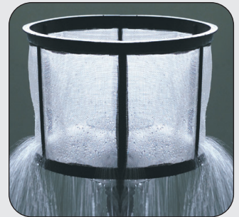
Shower head is built into the main strainer basket to easily put wettable powders into suspension