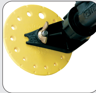
Rotating yellow calibration discs, adjusts easily to provide accurate and constant regulation of application