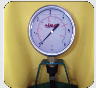
Large 3" dia. glycerin filled gauge, easy to see from tractor seat