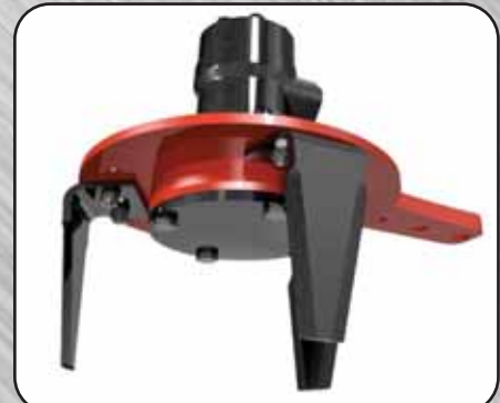
Option: Hydraulic driven power harrow w/3 replaceable blades