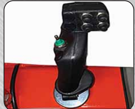
Joystick controls in storage position on cultivator

Note: Some tractor hydraulic systems may require a hose for return to sump (zero back pressure).