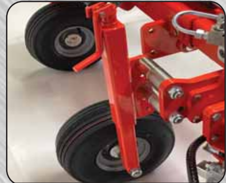
Screw jack adjustable dual gauge wheels