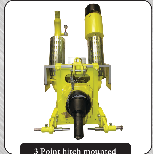
3 Point hitch mounted PTO driven air compressor